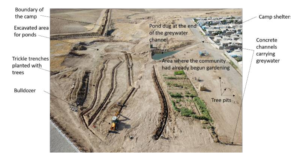
Fig. 09: The SuDS management train under construction in the Gawilan Refugee Camp, Kurdistan Region of Iraq. Charlesworth et al. 2019, p.3505.